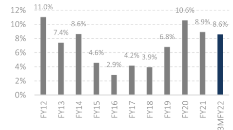
Chart-1: CPI inflation Trend